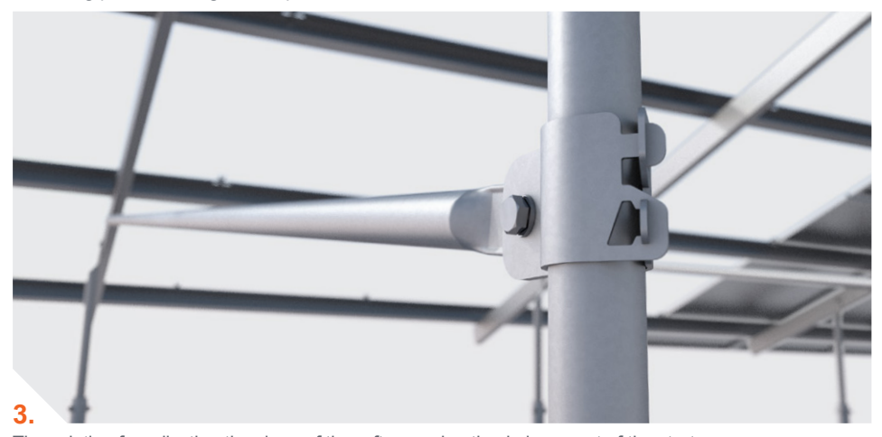
The solution for adjusting the slope of the rafters and optimal placement of the struts

GROUNDFIX is a European company based in Prague. Our company focuses on providing foundation solutions for every type of soil conditions. From standard soil, with easy installation, through low density, muddy terrain where a special type of propeller screw is necessary, to hard rocky terrain where predrilling technology is required. As well as ground screws we are able to provide rammed post foundations if clients prefer this technology and the soil conditions allow it.