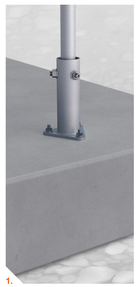
Fixation of the legs in the heel, fixed with a chemical anchor. Possibility of height adjustment of the stand.